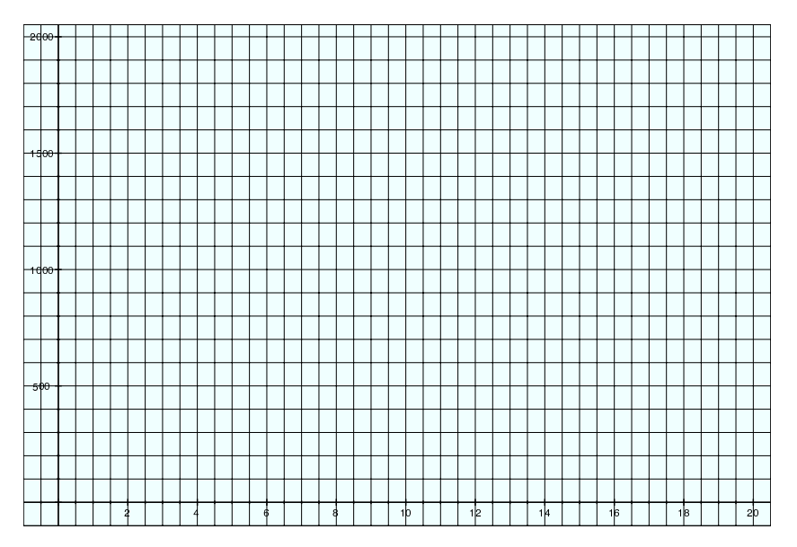
(c) What price p should she charge to make the most money?