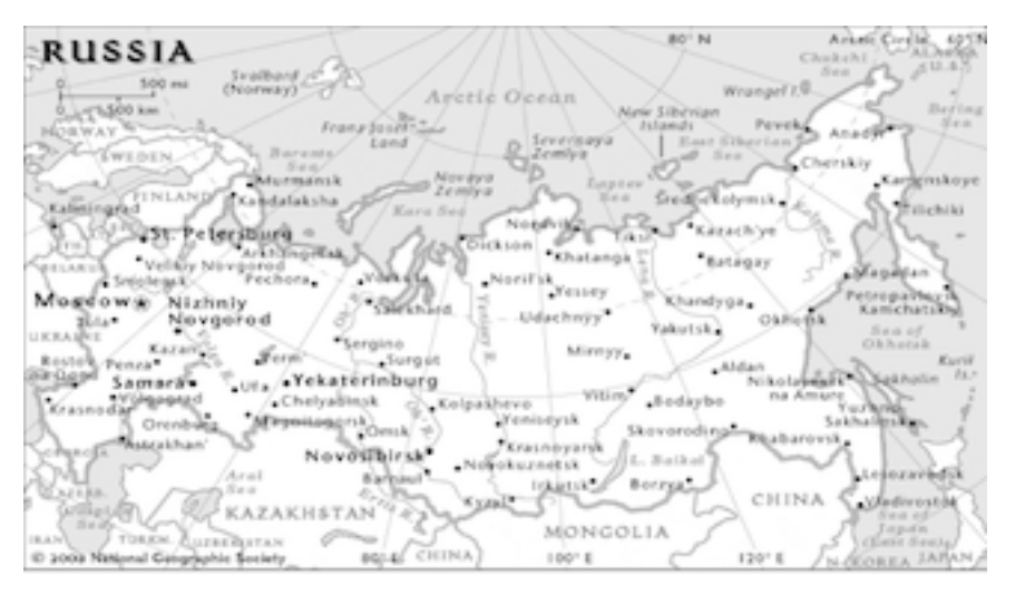
FIGURE 1. Map of Russia

2. The distance from St. Petersburg to Moscow is 660 km. From St. Petersburg to the town of Likovo it is 310 km, from Likovo to Kiln it is 200 km, and from Klin to Moscow is 150 km. How far is it from Likovo to Moscow?